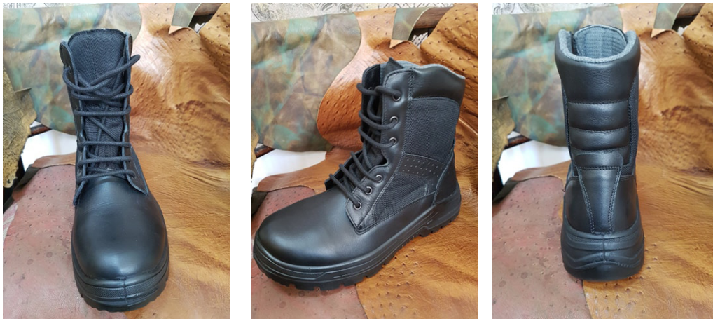
Figure 3. Multifunctional footwear for hot and cold weather